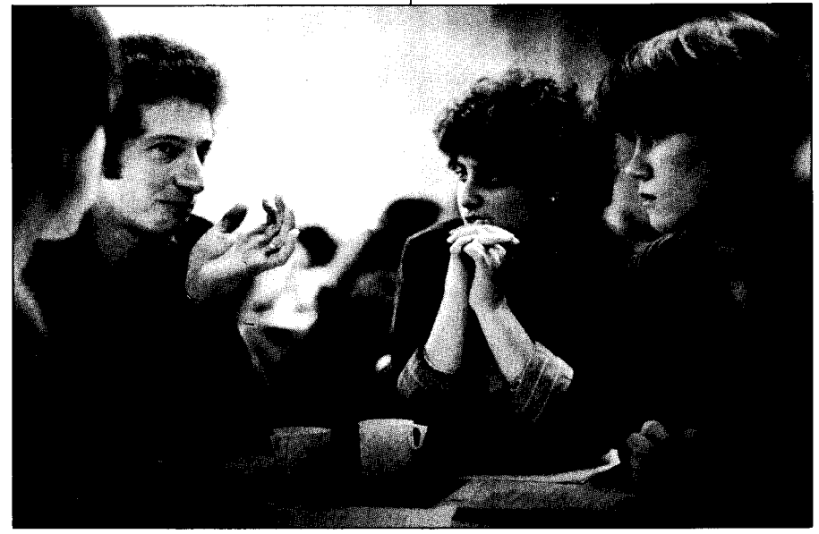
After studying factual information and planning their presentations, each advocacy team tries to convince the other of the correctness of its position regarding hazardous waste regulations.