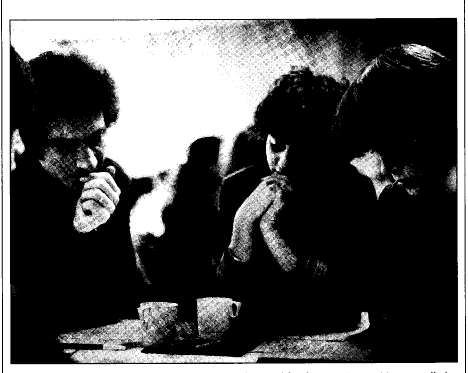
Once each team has presented its own position and argued for the opposing position as well, the group synthesizes both sides to write a report on the role of regulations in hazardous waste management.

tions in the Management of Hazardous Waste." One team is given the position that more regulations are needed, and the other team, that fewer regulations are needed. During the first hour, both teams receive materials supporting their assigned positions. The teacher instructs them to plan how best to support their assigned positions so that they and the opposing team learn the information and the perspective within the materials so well that the opposing team is convinced.