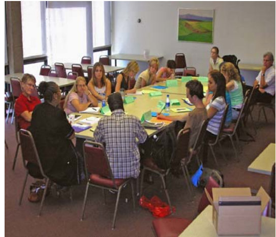
2007 Info Session

http://www.augsburg.edu/swk/bsw/bswcalendar.html