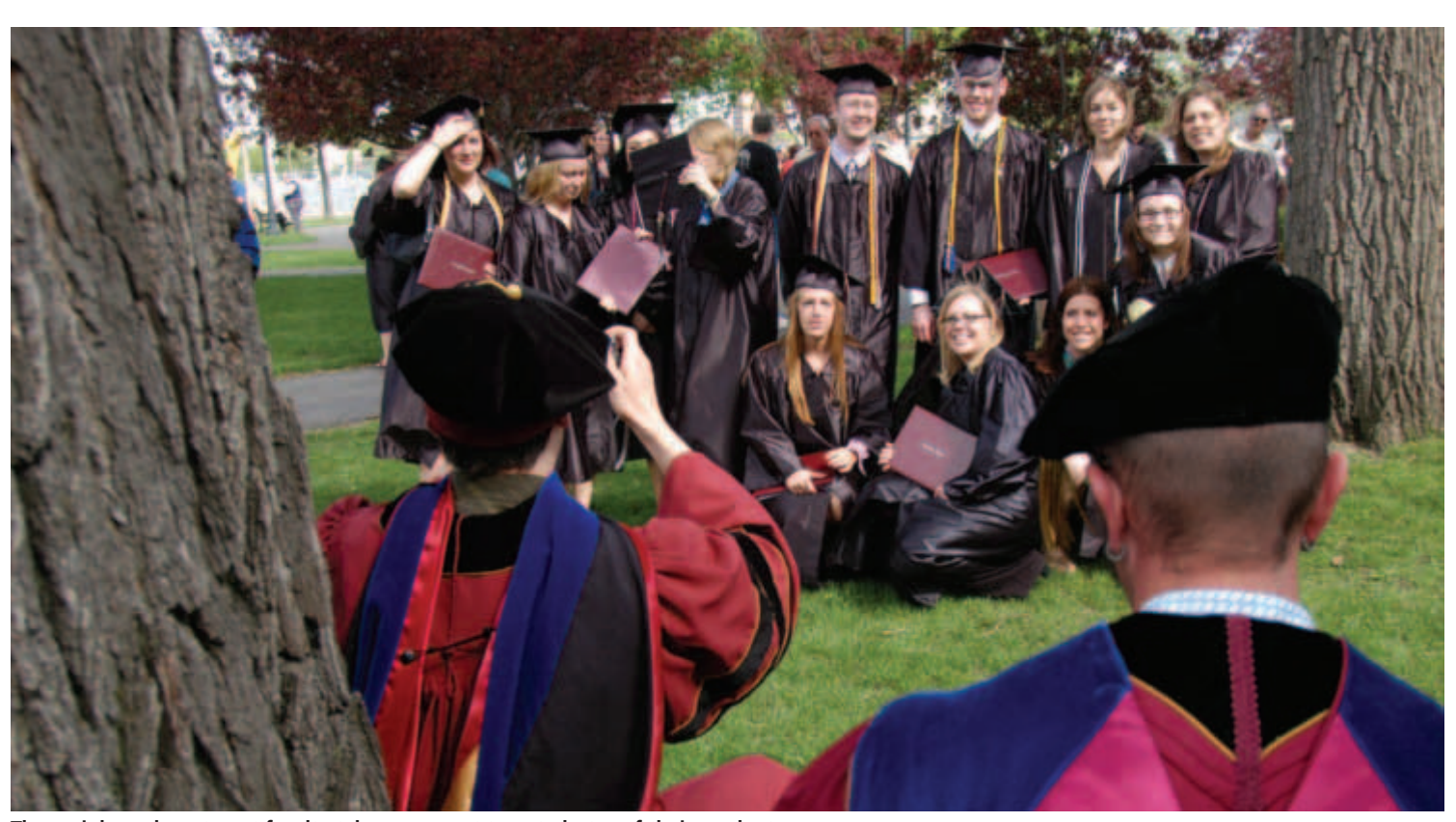
The sociology department faculty take a moment to get photos of their graduates.