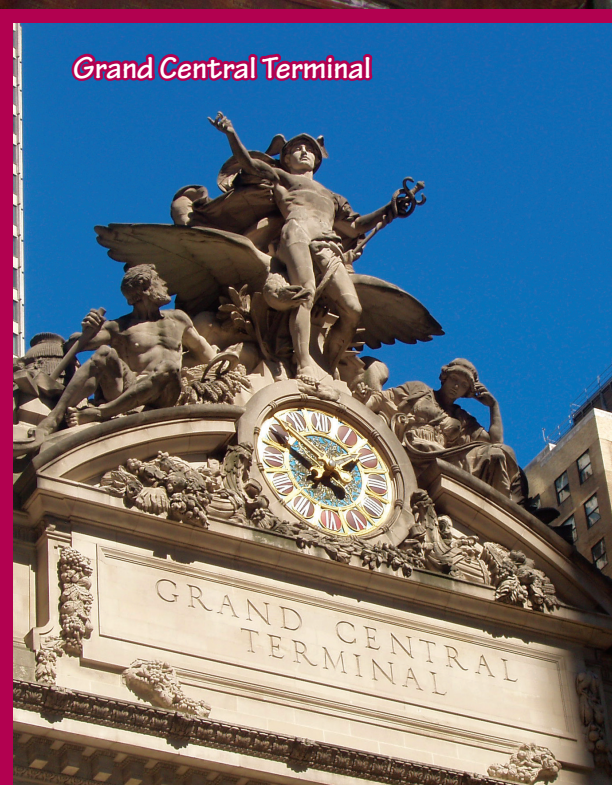
Grand Central Terminal