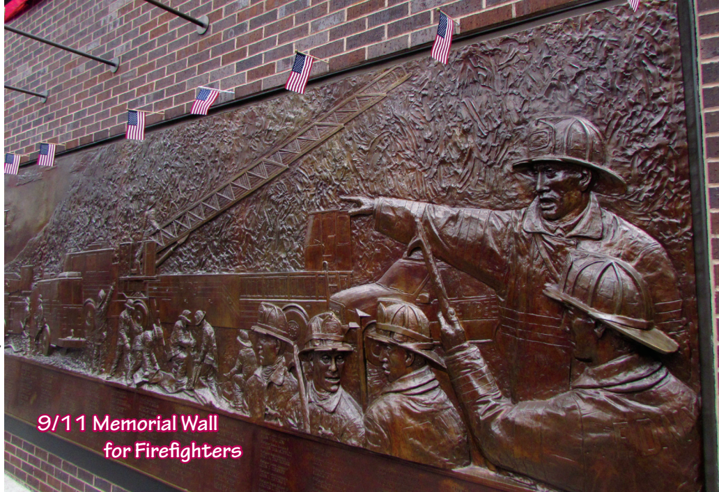
9/11 Memorial Wall for Firefighters