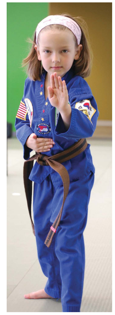
Fig. 2. A child demonstrating a tae-kwon-do stance.

Martial arts and mindfulness practices. Traditional martial arts emphasize self-control, discipline (inhibitory control), and character development. Children getting traditional tae-kwon-do training (Fig. 2) were found to show greater gains than children in standard physical education on all dimensions of EFs studied [e.g., cognitive (distractible-focused) and affective (quittingpersevering)] (28). This generalized to multiple contexts and was found on multiple measures. They also improved more on mental math (which requires working memory). Gains were greatest for the oldest children (grades 4 and 5), least for the youngest [kindergarten (K) and grade 1], and greater for boys than girls. This was found in a study where children 5 to 11 years old were randomly assigned by homeroom class to tae-kwon-do (with challenge incrementing) or standard physical education. Besides including physical exercise, martial-arts sessions began with three questions emphasizing self-monitoring and planning: Where am I (i.e., focus on the present moment)? What am I doing? What should I be doing? The later two questions directed children to select specific