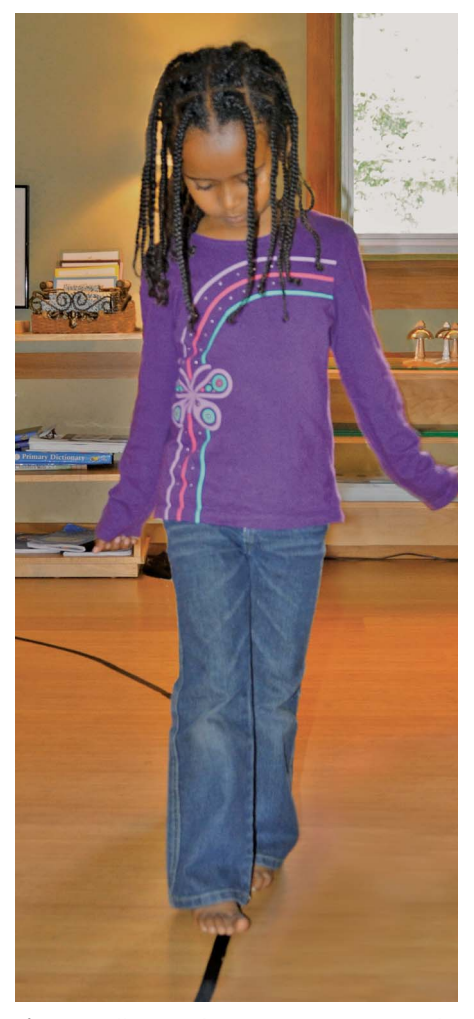
Fig. 3. Walking meditation in Montessori can be simply walking on a line (which required focused attention and concentration for young children) or walking on it without spilling water in a spoon or without letting your bell ring.

Montessori (36) curriculum does not mention EFs, but what Montessorians mean by "normal-